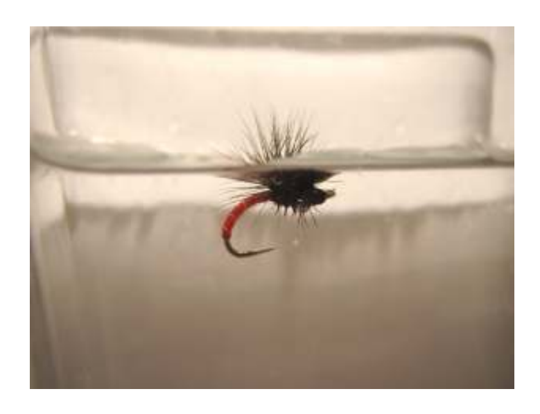
Spence's more flies than a shop Tying material; he's got the lot He'll give you a fly, you might wonder why Generosity plus that's what!

Picture of the finished fly and how it should float; Note floatant has only be applied to the hackle