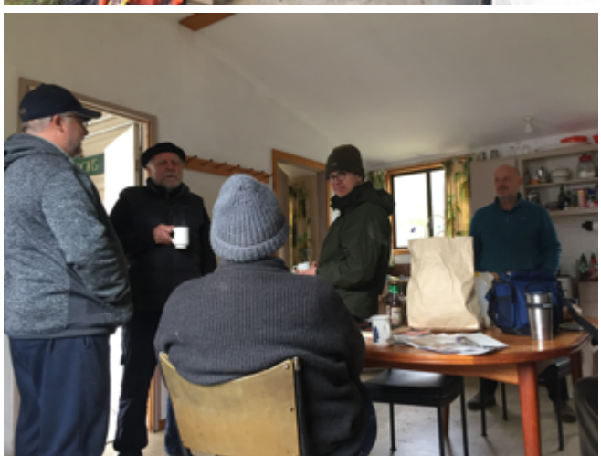
Many thanks to all involved in making sure this valuable club asset is maintained for the benefit of all our members.