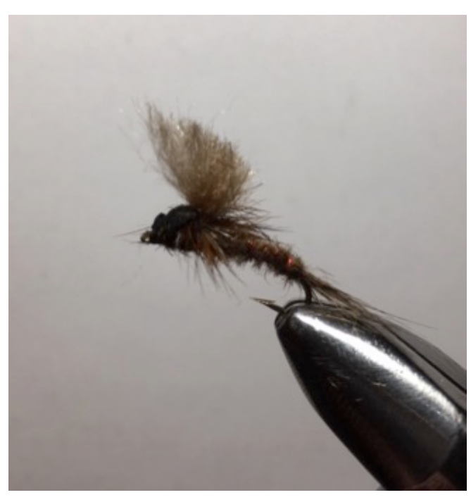
LM Emerger by Laurie Matcham

It is very simple to join in on these meetings – simply click on the links that are circulated weekly, make yourself comfortable, grab a refreshing glass and tune in!