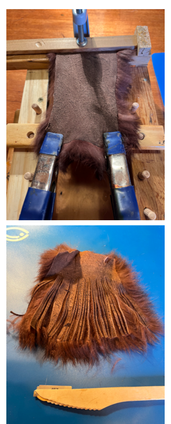
(I know some of these are a bit rough but ... they work!)

but I think that this will be a successful jig for a future of happy zonkering!