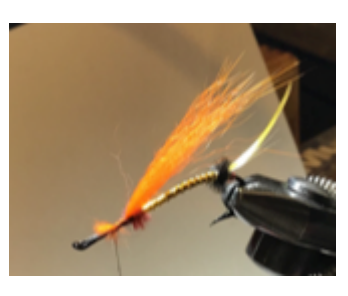
Wings: This is where the fun starts! Tie in your first layer of Arctic Fox. In this case it is the orange one. Make sure it is sparse and fine. Follow this with red and blue!