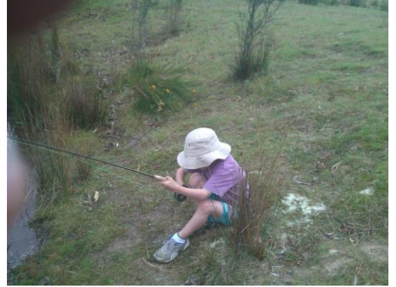
The slip literally