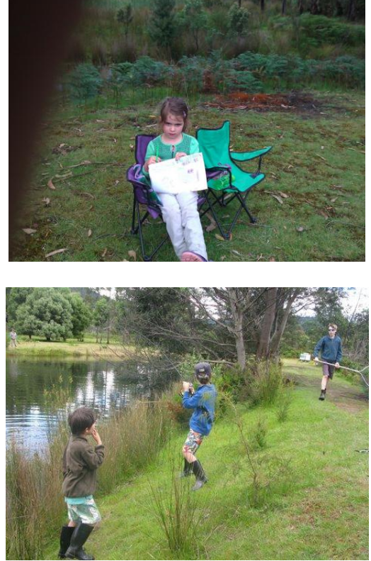
Unbelievably we had 3 broken rods 2 of them Sages.

Unfortunately a Bee keeper turned up just as the event commenced who stirred up a hive of bees. Even though we warned people before we started several people were stung a painful experience and potentially very dangerous. I will take steps to make sure this does not happen again.