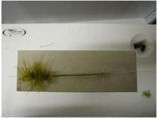
The dubbing brush with marabou hackle & body material

Also, as mentioned, dubbing brushes are another technique that the Nor-Vise does that I like. Another technique I like is making a dubbing brush for a marabou bugger that has the body material, the marabou hackle and ribbing made as one on the dubbing brush.