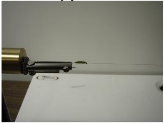
Dubbing body spun onto the hook

Also, as mentioned, dubbing brushes are another technique that the Nor-Vise does that I like. Another technique I like is making a dubbing brush for a marabou bugger that has the body material, the marabou hackle and ribbing made as one on the dubbing brush.