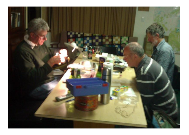
These blokes tied for The Vice

minor incident" associated with a problem tree that did not fall the right way and resulted in some damage. Fortunately no one was hurt. A big improvement overall.