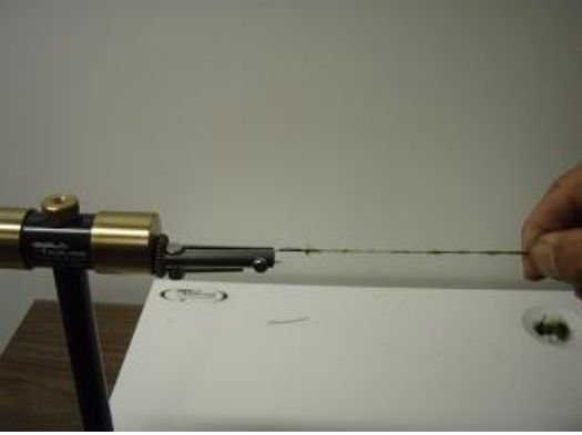
All dubbing spun onto the thread