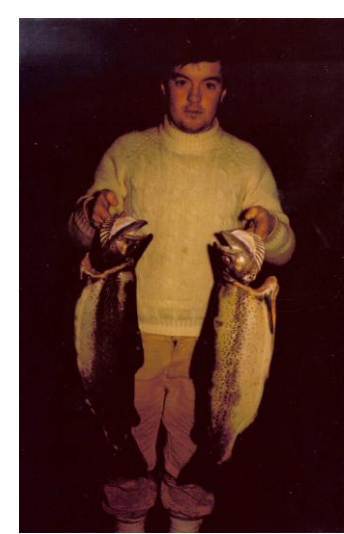
A younger Murray with Pedder Monsters