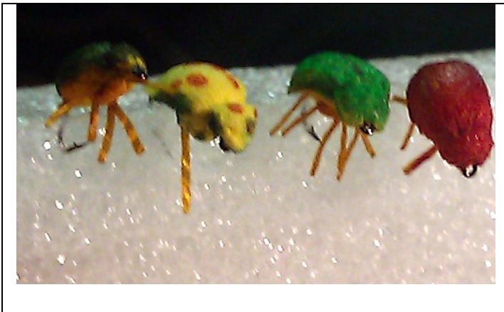
Name the fly and pick the best one!

minor incident" associated with a problem tree that did not fall the right way and resulted in some damage. Fortunately no one was hurt. A big improvement overall.