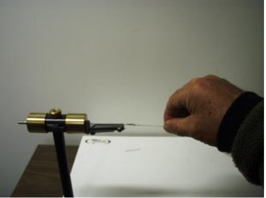
Starting to spin the dubbing onto the thread

then wound around the hook shank. Refer to the picture below.