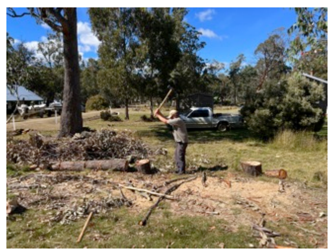
There were trees to lop And wood to chop And brush to cut out back!