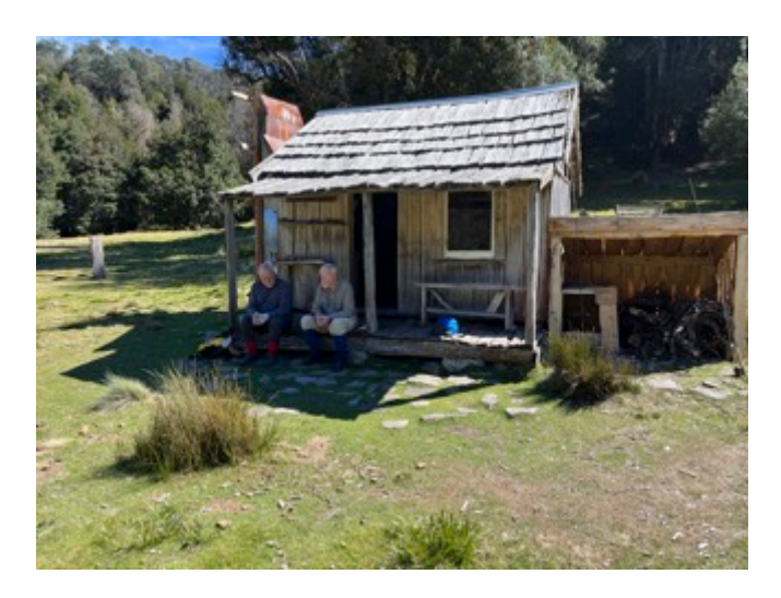
We visited Wadley's Hut on the second day, which has to be one of the cutest in the area. This little gem was about an hour away but we managed to spend most of the day getting there via very fishy waters and a few wrong turns.