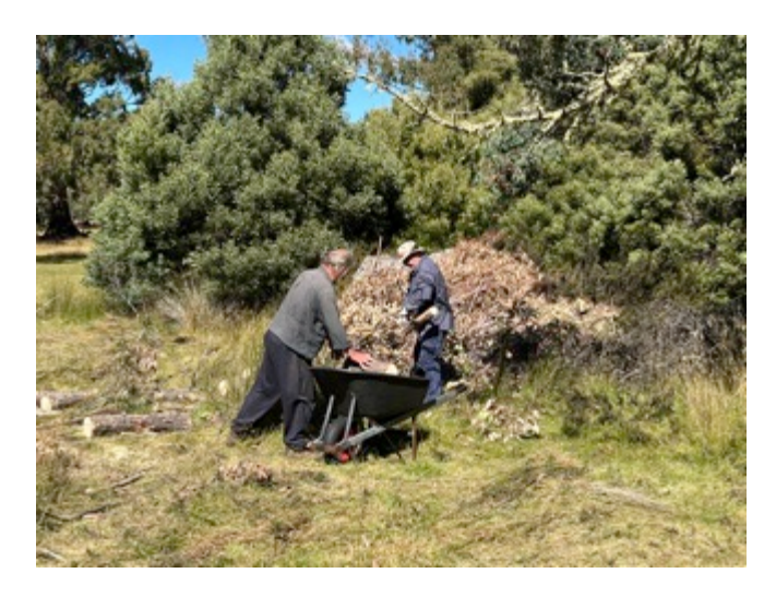
We'd all arrive By 10.05 With chainsaws gloves and gear

Our cheery bunch Worked hard 'til lunch When we stopped to have a beer