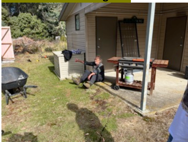
We all did well At Lake Sorell When we tidied up the shack.