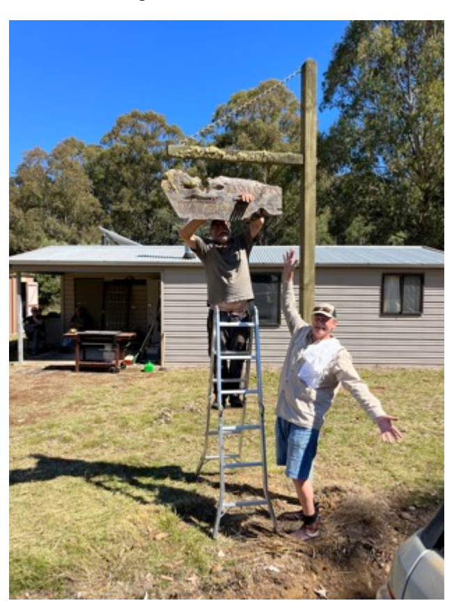
So thanks again To those brave men Who volunteered their time

The final task That one last ask To reinstall the sign