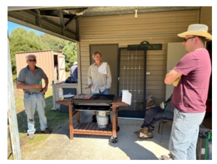
Then on we went All hell bent On making things all fine.

Our cheery bunch Worked hard 'til lunch When we stopped to have a beer