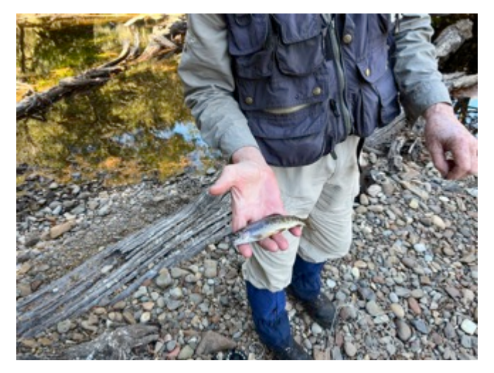
We all managed to catch fish. They were all small but beautifully coloured. Trotty, being the most athletic and daring of our number caught the most.