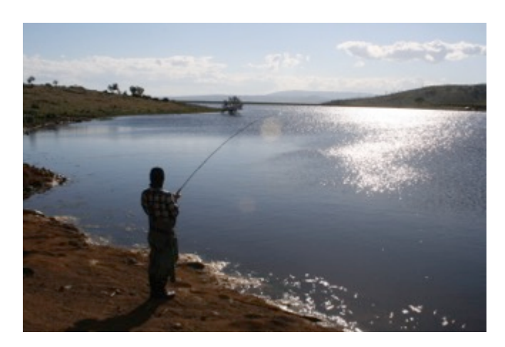
Saturday's weather was hot and sunny and wet fly fishing was generally the go. I went to visit the Wood

Some intrepid souls took on the challenge of getting on the water at first light, many heading off to the wonderful Weasel Plains only to return a little bewildered at the massive hatch and almost total absence of fish rising to them. There were some great fish caught but many of the dry fly enthusiasts chose to return to Henry's place and the monsters therein!