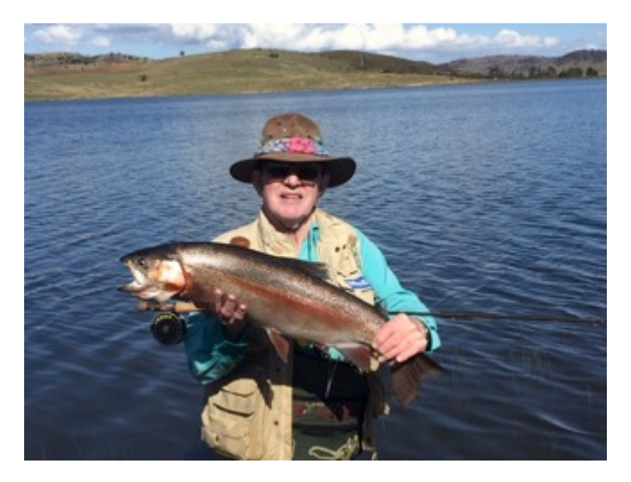
The fish ranged from around 1lb to well over the magical 10 and all were in exceptional condition, which indicates just how healthy the environment they lived in was.

As more people arrived they spread themselves out over the length and breadth of the five venues on offer. The size of the fish was only outdone by the smiles of the lucky anglers.