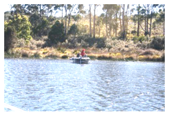
Don't drive your boat through water you wan to fish. It sounds obvious but sometimes-even Editors forget this basic rule!

Take time to get your Drogue set square and the boat tracking properly. It will take a bit of time but it is worth it.