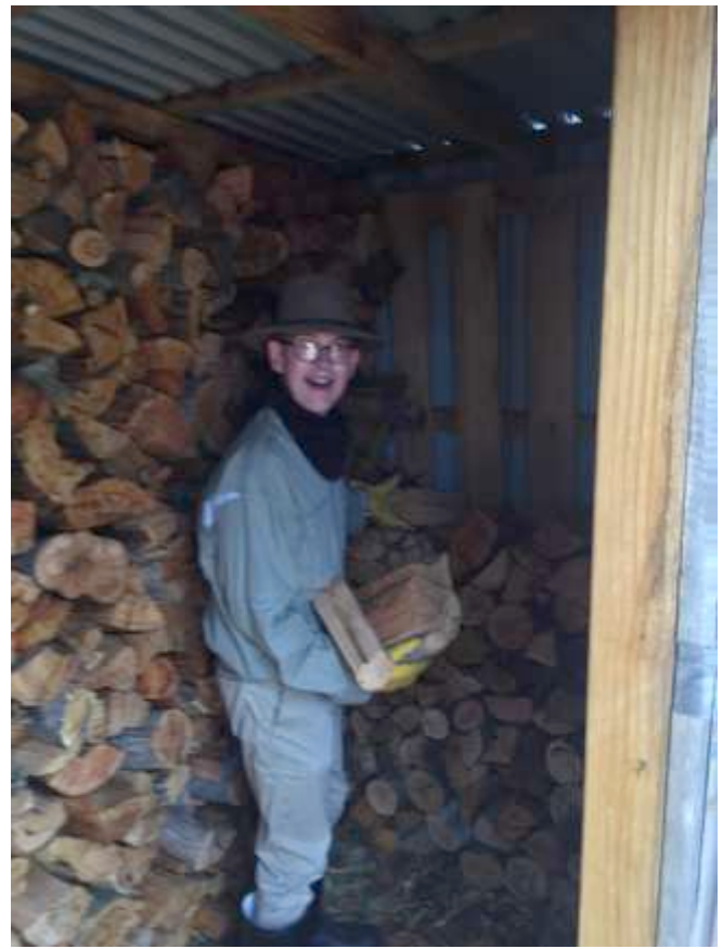
So if you do avail yourselves of the excellent Club Shack and do light a fire to sit in front of and reflect on the days fishing be impressed by the efforts that go into making everything just that little bit more comfortable!

Lunch was provided and everyone felt pretty good about themselves!