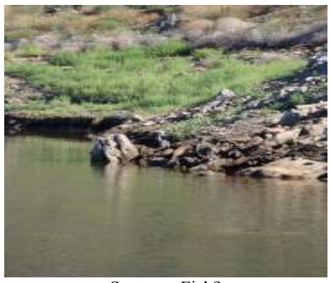
Spot any Fish?