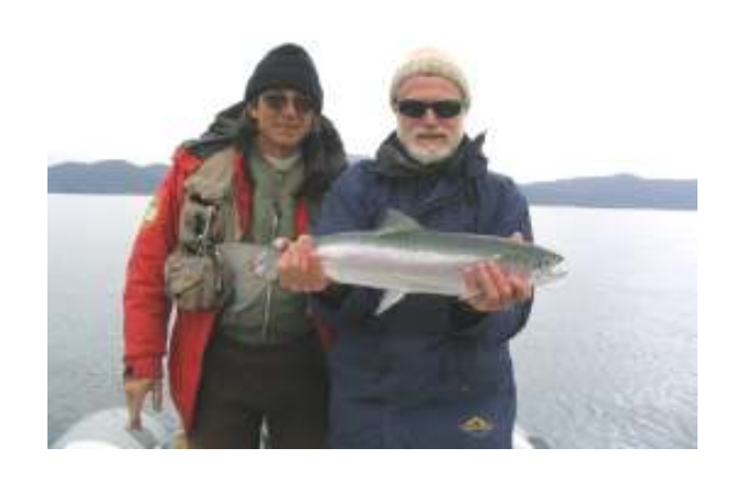
"Murph" with a Cracking South American Rainbow

When Pete replaced the flat green line with a plastic line there was no room for backing so the skill to control and dominate a fish was picked up by necessity.