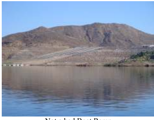
Not a bad Boat Ramp