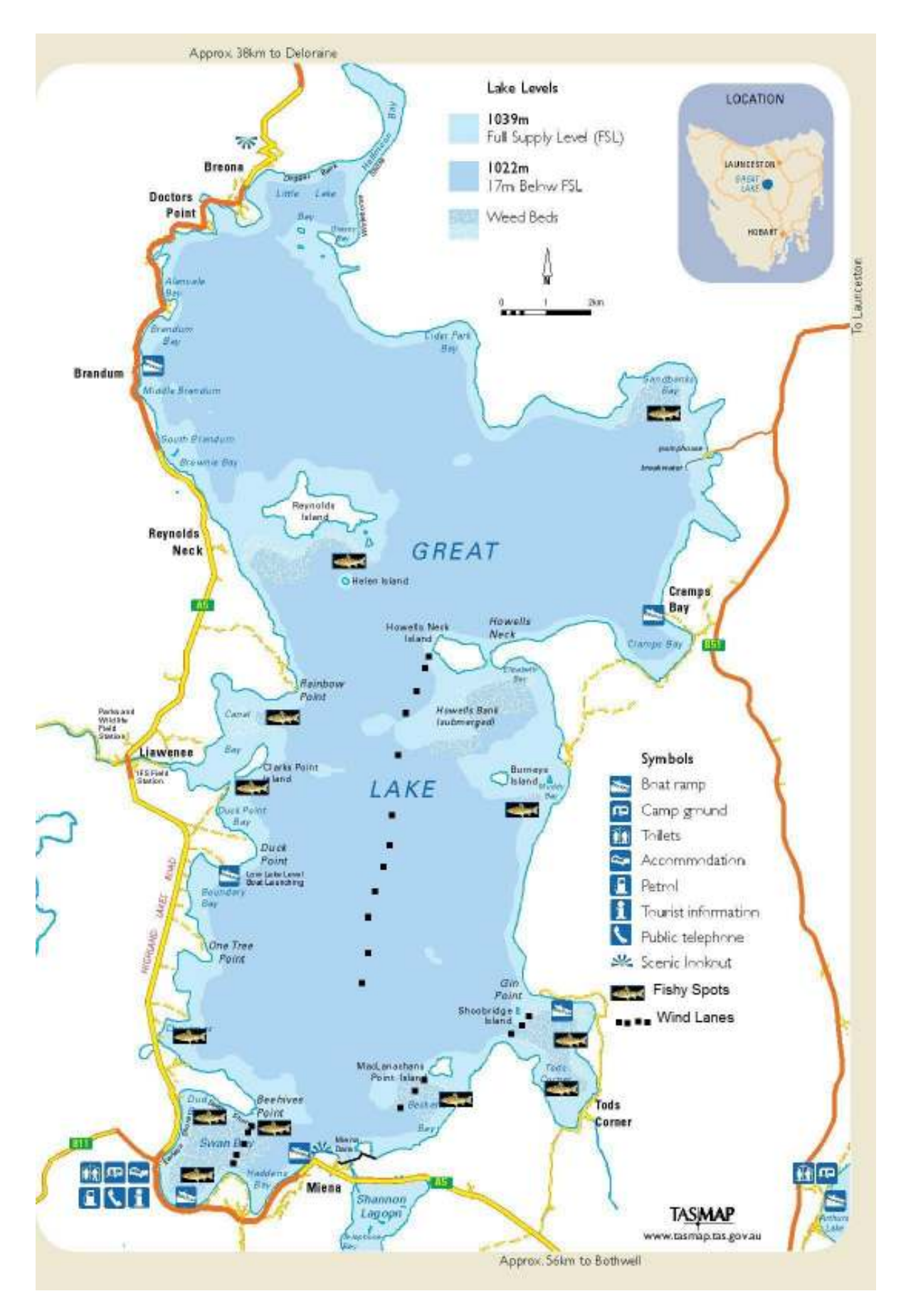
Anglers Alliance Tasmania has allowed us to use the background map. See the great Inland Fisheries Access brochures prepared with help from Australian Government, Hydro Tasmania and Anglers Alliance Tasmania