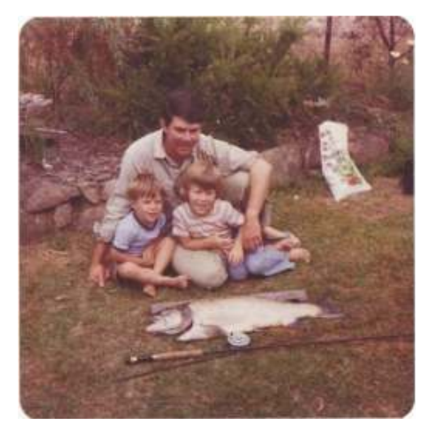
A 10lb Lake Pedder Brown and two little Abbotts.

My fondest memory is of the day I fished to rising fish all day on the Macquarie and caught my bag (12) using a red spinner. Both red and black spinners were over the water and some trout were fussy about which one, but I didn't change flies, just moved on to another run. I had such a pleasant day that I left the river midafternoon with fish still rising. I kept the biggest fish, 4lb, by far the largest. This was in November 1996, after a flood in September, the last time the river flooded and ran strong and clear with prolific hatches.