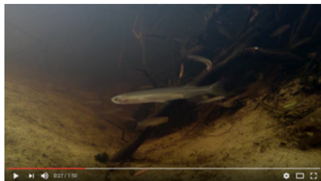
Native Fish: Common Galaxias or Jollytail ( Galaxias maculatus ).

Anyone wanting to fish at Tooms Lake will know about the galaxia that inhabit this wonderful piece of the world. I was fortunate enough to hook one at the end of last season and took a photo of it with my phone along with the bedraggled fly that caught it. (I also did manage to catch 2 really nice trout as well)