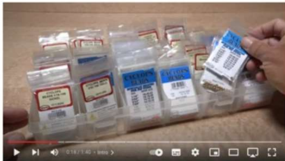
Fly Tying Tips & Techniques Coloring Beads

You never know, there may even be a chance to use a dry fly in the near future now that the long winter of our discontent seems like finally abating!